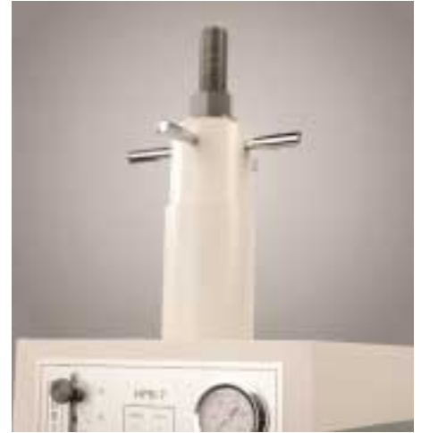
Precision Depth Stop