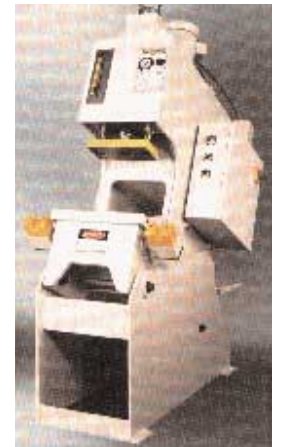
10-Ton Hydraulic OBI