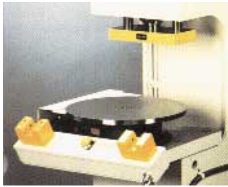
Rotary Index Table